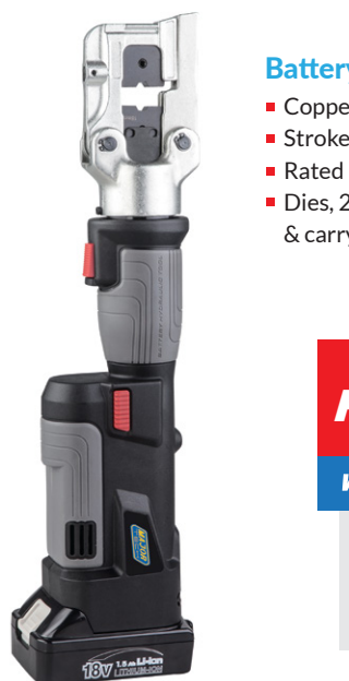
Battery Powered Crimping Tool Copper 240mm 2 / Aluminium 185mm 2 Stroke: 14mm Rated pressure: 50kN Dies, 2x 2.5Ah Lithium batteries, charger & carrying Case