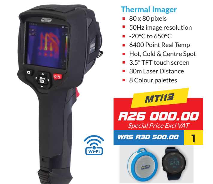
Thermal Imager 80 x 80 pixels 50Hz image resolution -20°C to 650°C 6400 Point Real Temp Hot, Cold & Centre Spot 3.5" TFT touch screen 30m Laser Distance 8 Colour palettes