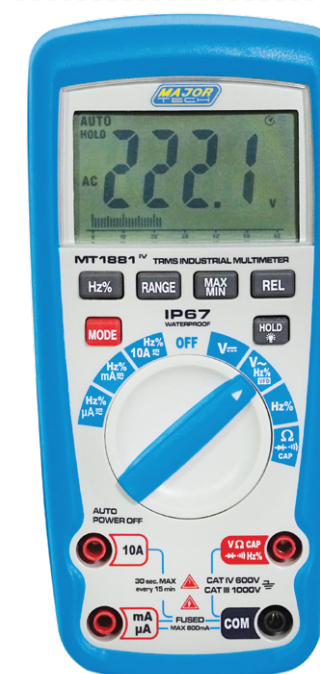
TRMS Multimeter 1000V AC/DC 4000 \mu F Capacitance \Omega & Hz IP67 6000 Count CAT IV 600V