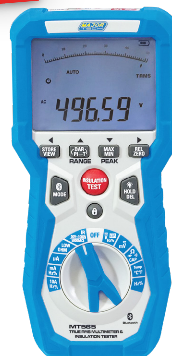
Insulation Tester & TRMS Multimeter 50V-100V-250V-500V-1000V 5G \Omega 1000V AC/DC Temp, \Omega , CAP & Hz CAT IV 600V