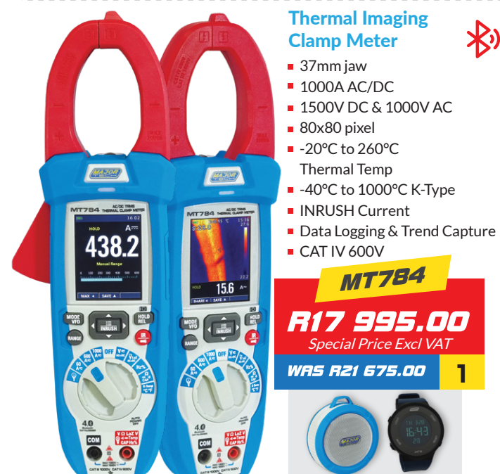
Thermal Imaging Clamp Meter 37mm jaw 1000A AC/DC 1500V DC & 1000V AC 80x80 pixel -20°C to 260°C Thermal Temp -40°C to 1000°C K-Type INRUSH Current Data Logging & Trend Capture CAT IV 600V