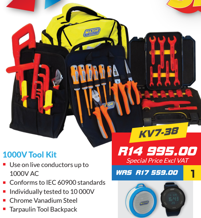
1000V Tool Kit Use on live conductors up to 1000V AC Conforms to IEC 60900 standards Individually tested to 10 000V Chrome Vanadium Steel Tarpaulin Tool Backpack