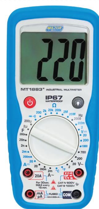
Manual Ranging Multimeter 1000V DC & 700V AC -20°C to 760°C K-Type 200 \mu F Capacitance \Omega & Hz IP67 2000 Count CAT IV 600V