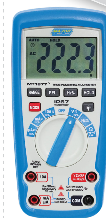
TRMS Multimeter 1000V AC/DC 99.99mF Capacitance \Omega & Hz IP67 4000 Count CAT IV 600V