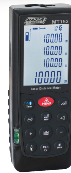
Laser Distance Meter 100m Built-in spirit Level Area, volume calculations Indirect measurement using Pythagoras Tripod thread Backlit Display