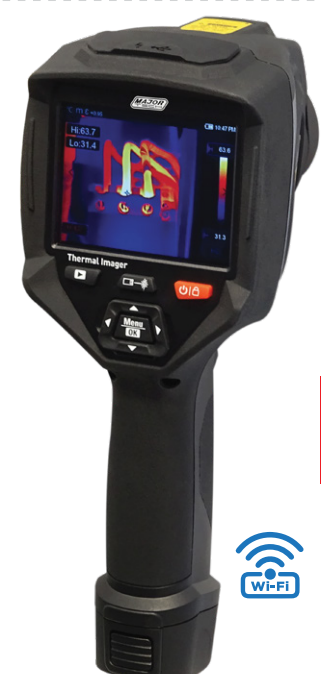
Thermal Imager 384x288 pixels 50Hz image resolution -20°C to 650°C 110 592 Point Real Temp Hot, Cold & Centre Spot 3.5" TFT touch screen 30m Laser Distance 8 Colour palettes