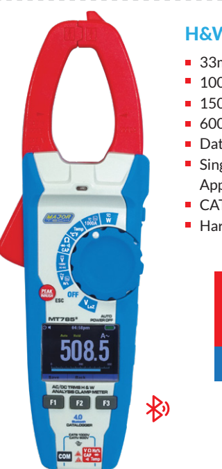
H&W Analysis Clamp Meter 33mm jaw 1000A AC/DC 1500V DC & 1000V AC 6000 \mu F Capacitance Data Logging & Trend Capture Thermal phase - Active, Reactive, Apparent and Power Factor CAT IV 600V Harmonic 1-25