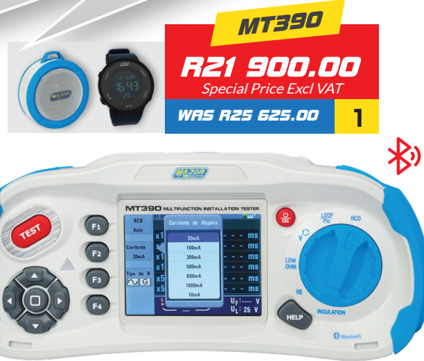
MT390: Multifunction Tester Insulation & earth resistance Continuity & RCD test Loop/PSC & phase rotation Voltage, current & Frequency CAT IV 400V