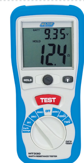
Earth Resistance Tester 2000 \Omega earth resistance 200V earth voltage 1000V DC / 750V AC 200k \Omega resistance CAT IV 600V