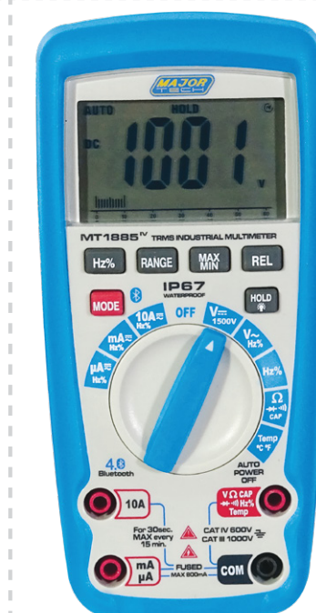
TRMS Multimeter 1500V DC & 1000V AC -20°C to 1000°C K-Type 100mF Capacitance \Omega & Hz IP67 6000 Count CAT IV 600V