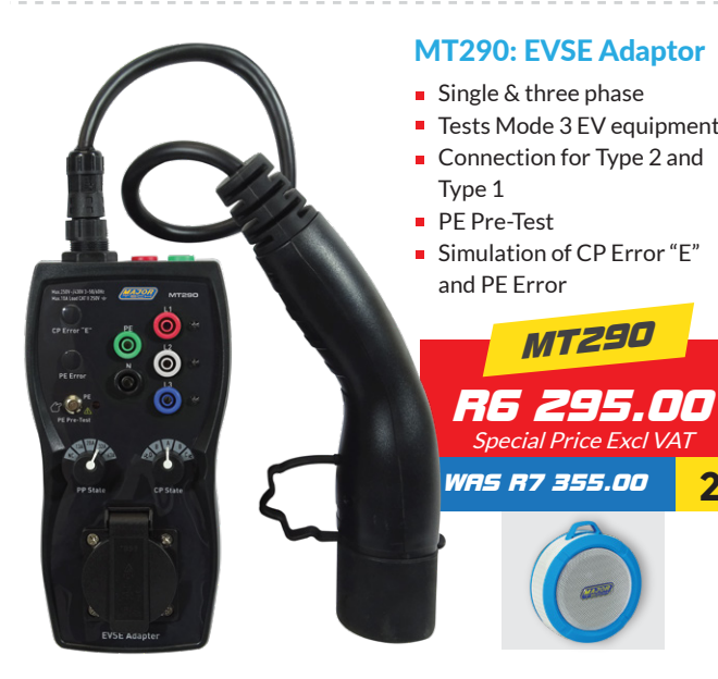
MT290: EVSE Adaptor Single & three phase Tests Mode 3 EV equipment Connection for Type 2 and Type 1 PE Pre-Test Simulation of CP Error "E" and PE Error