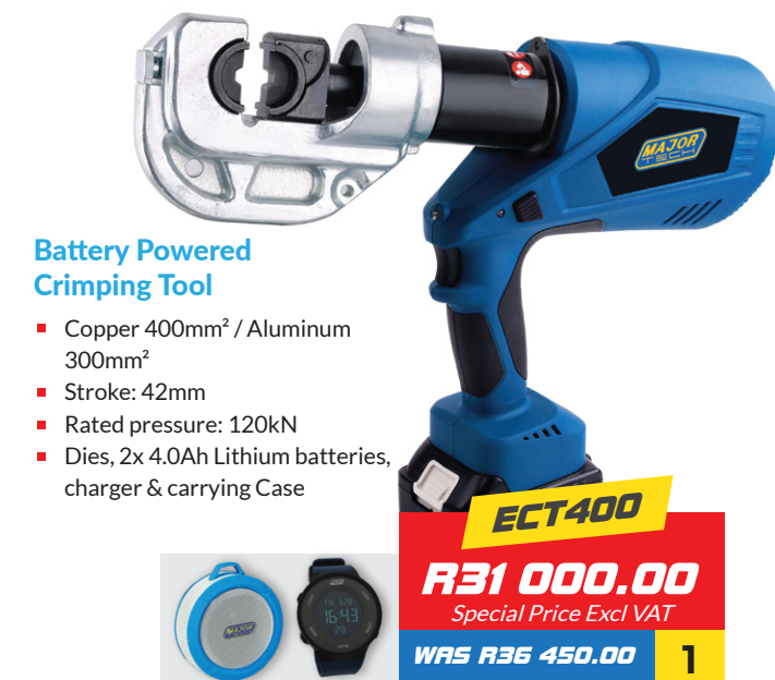
Battery Powered Crimping Tool Copper 400mm 2 / Aluminum 300mm 2 Stroke: 42mm Rated pressure: 120kN Dies, 2x 4.0Ah Lithium batteries, charger & carrying Case