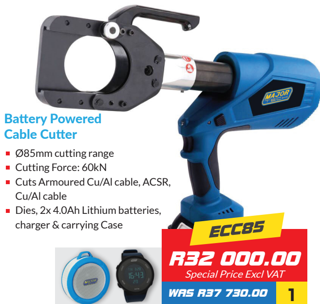
Battery Powered Cable Cutter \varnothing 85mm cutting range Cutting Force: 60kN Cuts Armoured Cu/Al cable, ACSR, Cu/Al cable Dies, 2x 4.0Ah Lithium batteries, charger & carrying Case