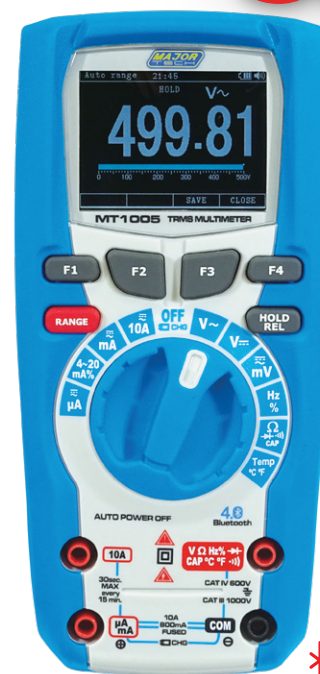
TRMS Multimeter 1000V AC/DC -200°C to 1350°C K-Type 10mF Capacitance IP67, \Omega & Hz Data Logging & Trend Capture 50000 Count TFT Display CAT IV 600V