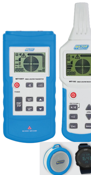
Cable Locator 12V to 400V AC/DC Transmitter Measurement Detects interruptions & short circuits in cables & concealed electrical circuits, identifies fuses/breakers and assigned current circuits. CAT III 300V