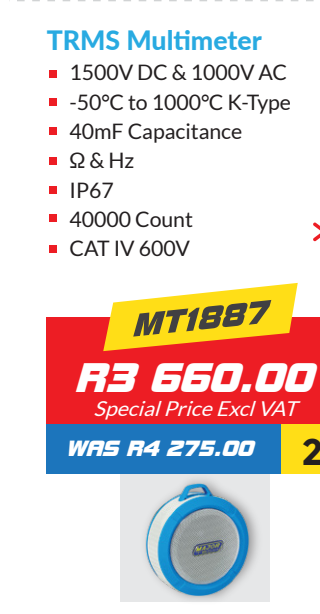
TRMS Multimeter 1500V DC & 1000V AC -50°C to 1000°C K-Type 40mF Capacitance \Omega & Hz IP67 40000 Count CAT IV 600V