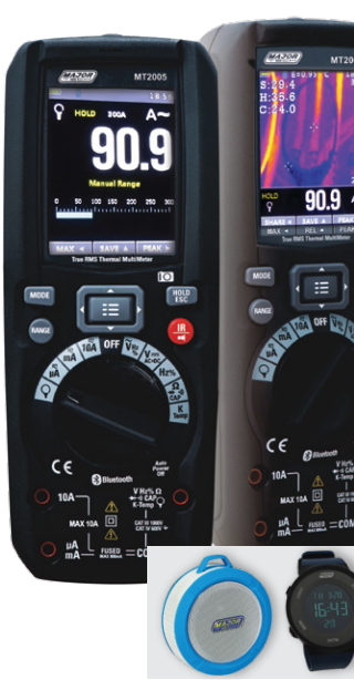
Thermal Imaging Multimeter 1000V AC/DC 6mF Capacitance \Omega & Hz -20°C to 260°C Thermal Temp -40°C to 600°C K-Type 6000 count TFT display 80 x 80 pixel CAT IV 600V