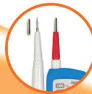
4mm Screw on Probe Tip Extension