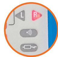
Rotary Field Indication, Continuity & Low Impedance