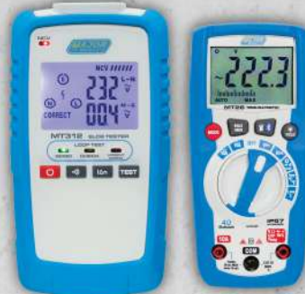
MT26 COMBO 7