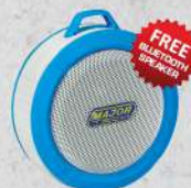
MT26 COMBO 8