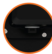
Breather Hole to Prevent Condensation on LEDs