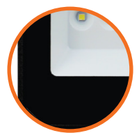
IP65 Water and Dust Proof Resistant