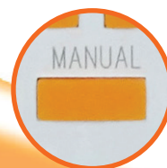
On/Off Auto Switch