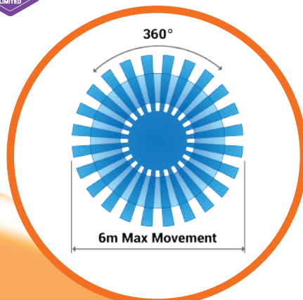
360° Detection Range