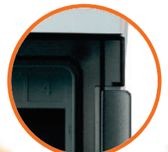
Effortless Push-To-Open Mechanism