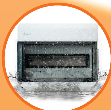
IP66 Waterproof and Dustproof