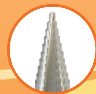
Drill numerous sizes of holes with the one cutter