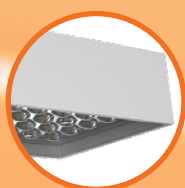
Solar Panel Installed on Top of the Wall Light