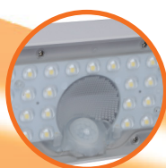
6m PIR Sensor Range