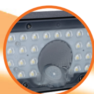
6m PIR Sensor Range