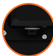
Breather Hole to Prevent Condensation on LEDs