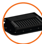
Durable Aluminium Housing