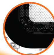
IP65 Water and Dust Proof Resistant