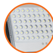
Spherical Diffuser Design