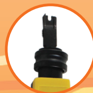
Can be used with either Krone or 110 style blades