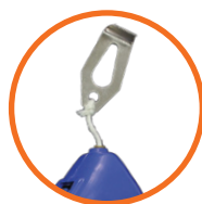
Pure cotton Line