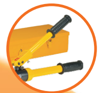
High-strength tubular handles with rubber grips

HCC45 | Hydraulic Cable Cutter up to Ø45mm