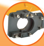
High quality drop forged crimpers