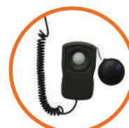
Sensor with 1,2M Extension