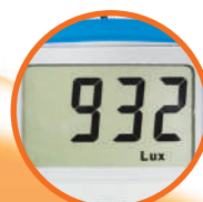
3½ Digits Large Display